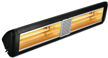
ATC Sienna 4000W Infrared Heater Black