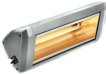
ATC Sienna 2200W Infrared Heater Silver