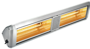
ATC Sienna 4000W Infrared Heater Silver