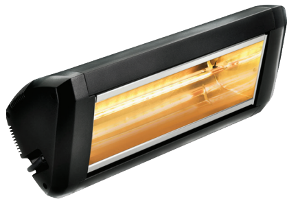
ATC Sienna 2200W Infrared Heater Black